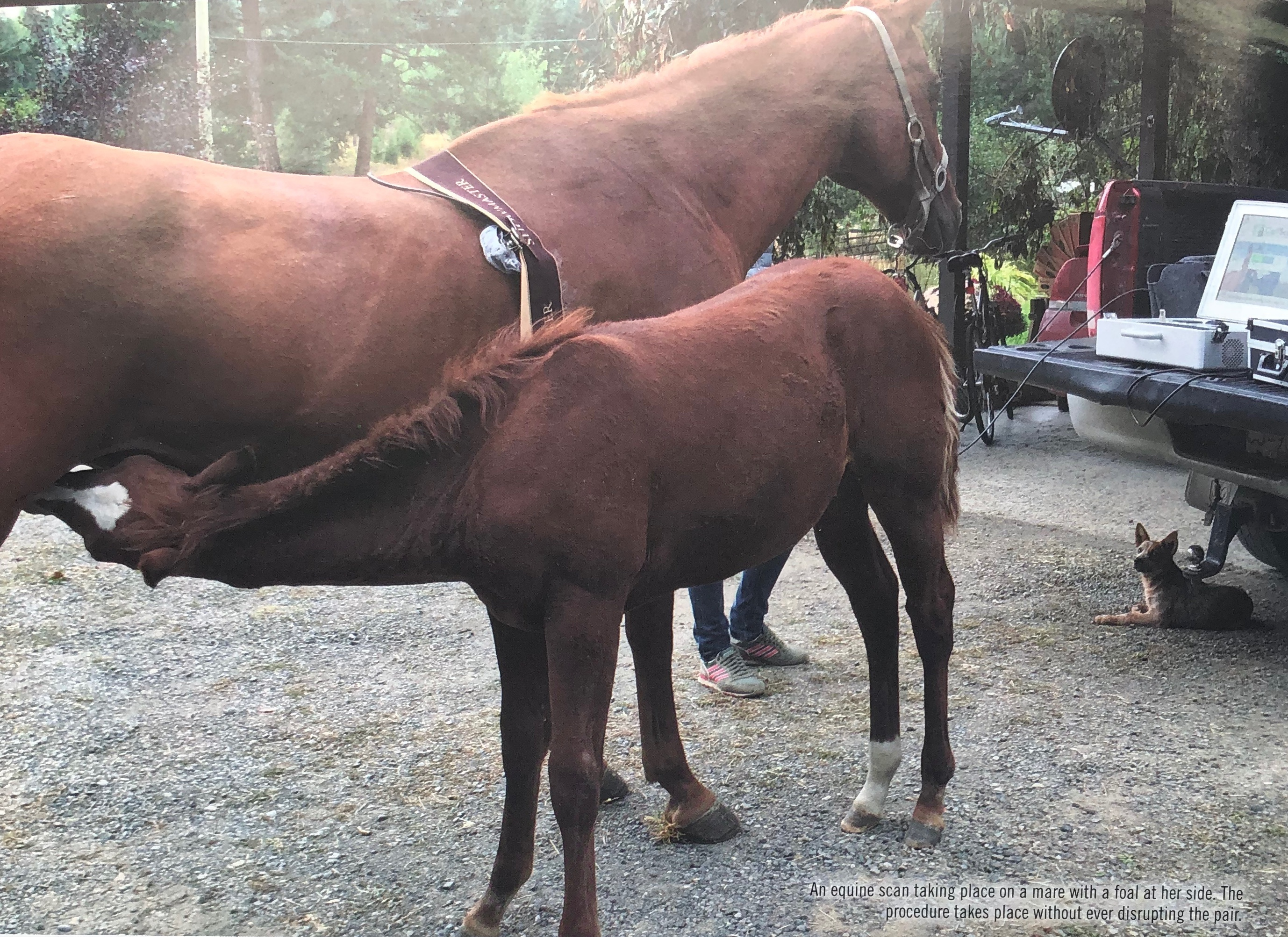
An equine scan taking place on a mare with a foal at her side. The procedure takes place without ever disrupting the pair.