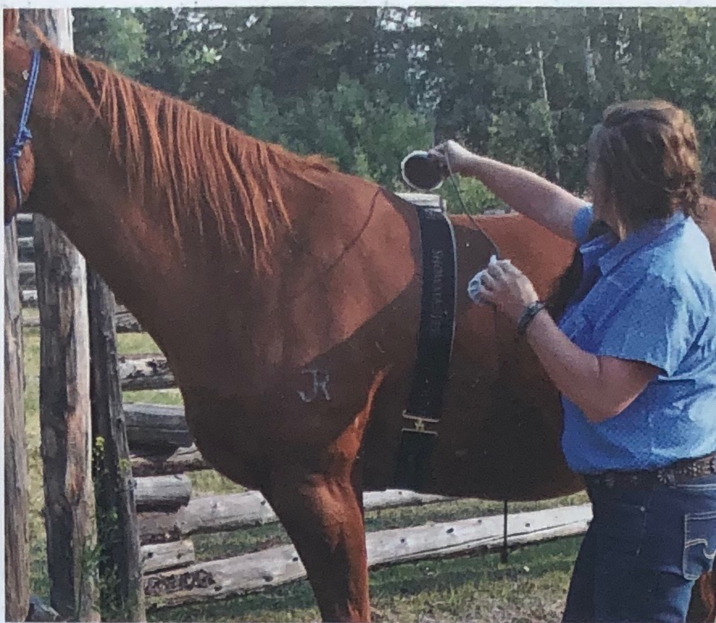
An emitter and a wave receiver is placed on the horse's body and attached by a waist belt.

The measuring procedure is non-invasive and designed for mobile outdoor use. The scan