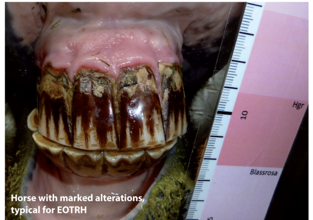
Horse with marked alterations, typical for EOTRH