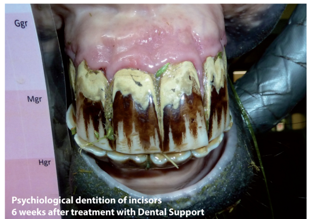
Psychological dentition of incisors 6 weeks after treatment with Dental Support